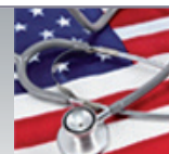
Keynote Drug Pricing and Trump Administration