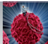
New Wave Innovations in Vaccines