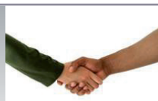
Life Science Venture Capital