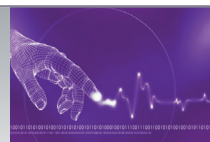
Inflammatory skin diseases