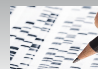
The Promise of Gene Therapy