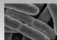
The Gut Microbiome: Opportunities and Challenges