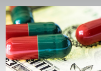
Making Medicines Affordable